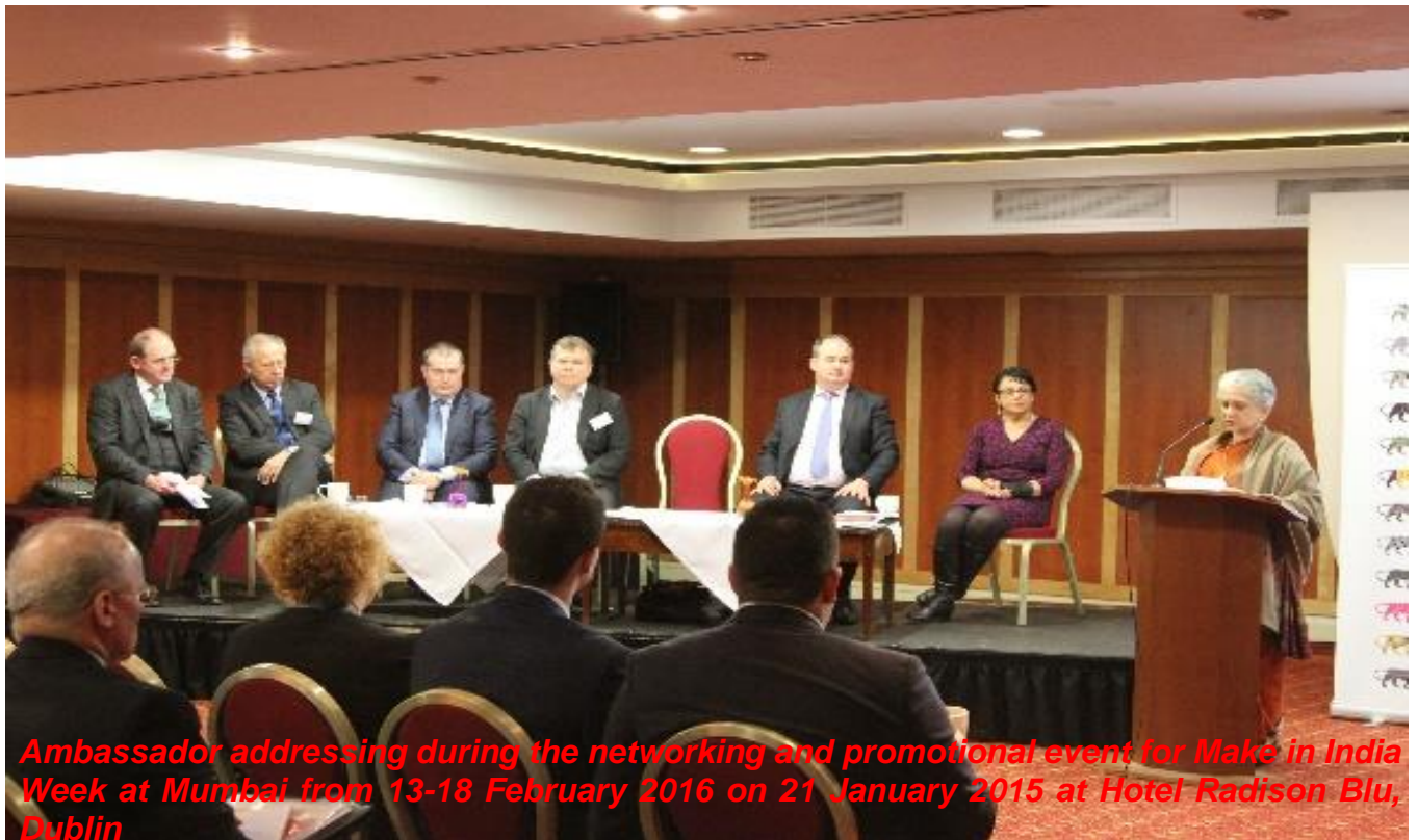
Ambassador addressing during the networking and promotional event for Make in India Week at Mumbai from 13-18 February 2016 on 21 January 2015 at Hotel Radison Blu, Dublin

To promote 'Make in India Week - Mumbai from 13-18 February 2016, a networking and promotional event was organised by Embassy of India with the support of Ireland-India Business Association at Hotel Radisson Blu on 21 January 2016.