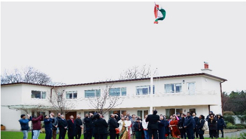
◀Ambassador of India hoisting the Indian National Flag on 26 January 2016.

Ambassador read out the President's Address and the copy of the President's Address in Hindi and English were distributed.