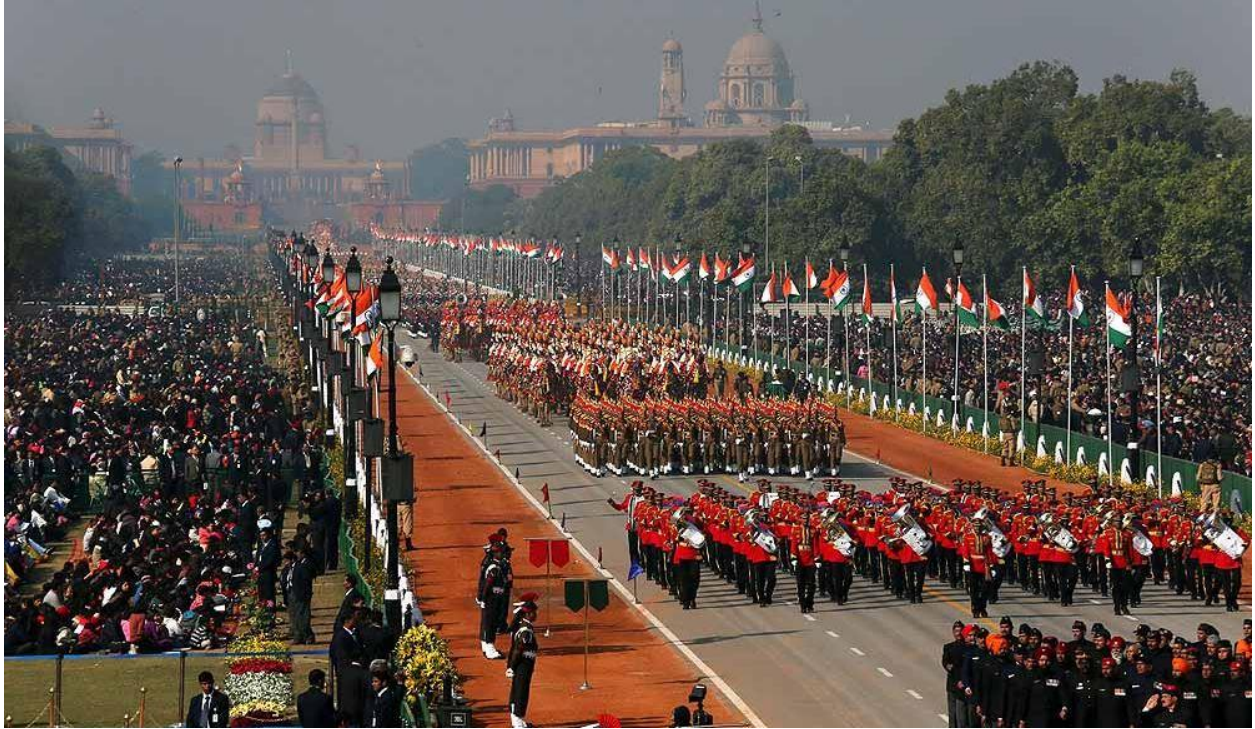
The Republic parade 2016 at Rajpath, New Delhi