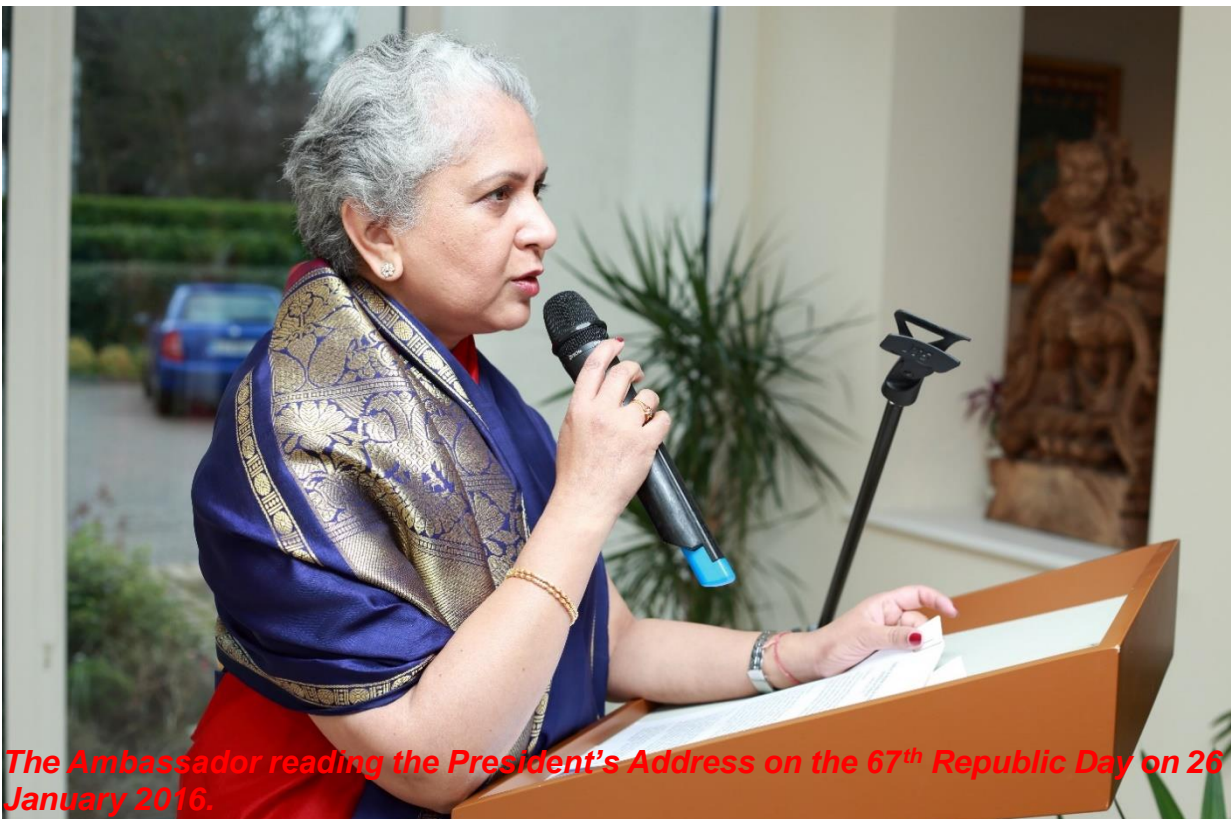
The Ambassador reading the President's Address on the 67 th Republic Day on 26 January 2016.