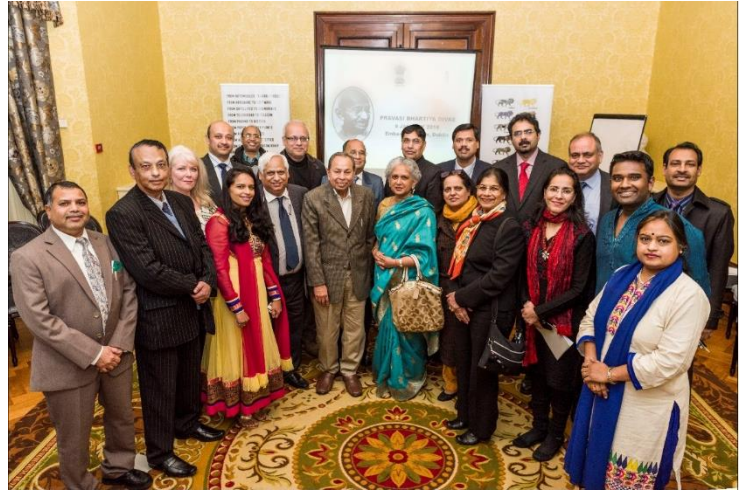
Ambassador and other members of the Embassy and Indian diaspora on the occasion of PBD 2016.