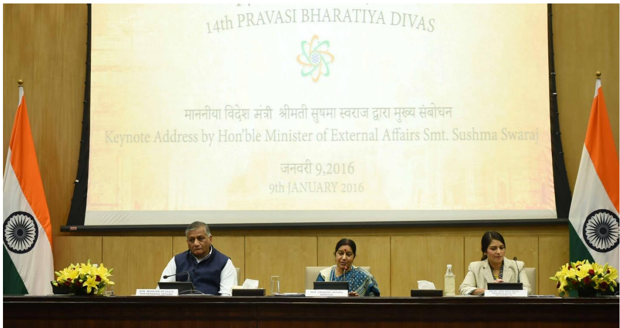
External Affairs Minister, Minister of State for External Affairs and The Rt. Hon'ble Priti Patel, Minister of State for Employment of United Kingdom at the 14th Pravasi Bharatiya Divas in New Delhi (January 09, 2015)