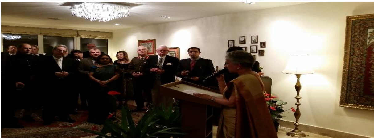
Ambassador addressing the guests at the official reception.