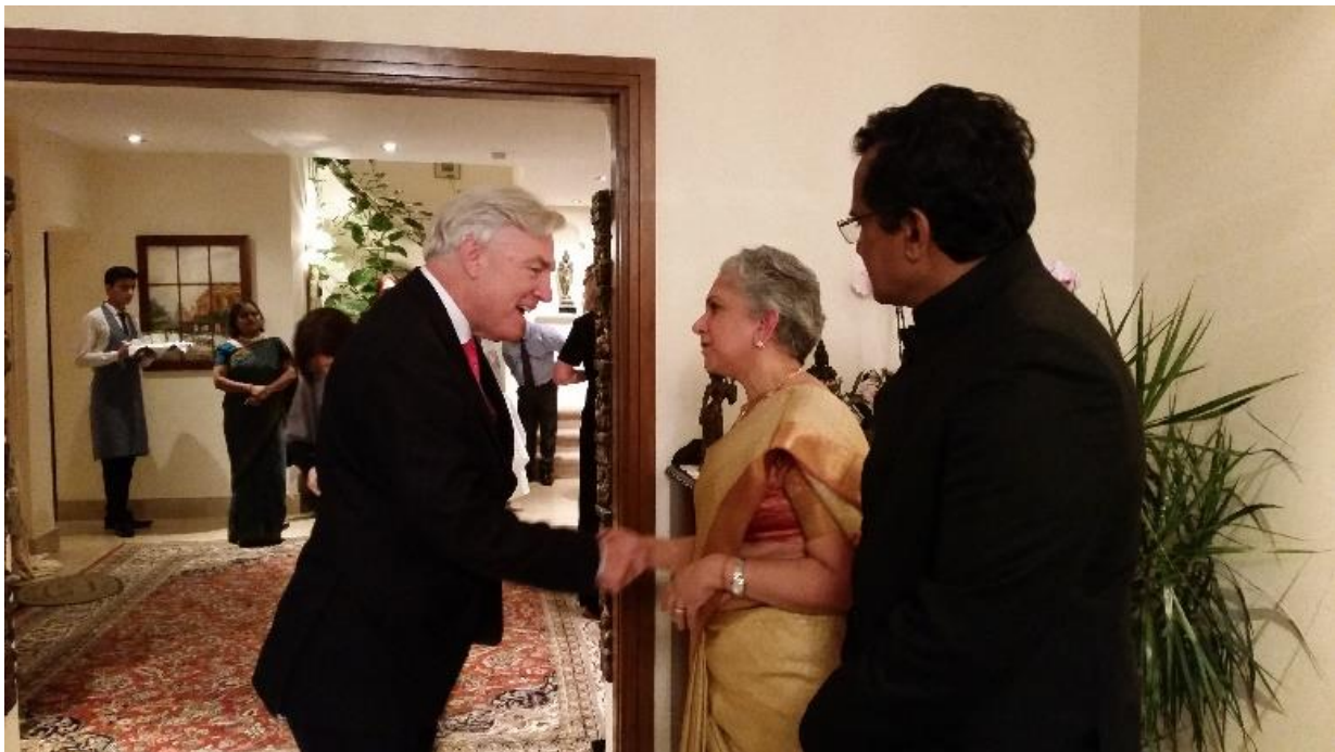
Ambassador greeting the guests at the official reception on 26 January 2016.

On the occasion of the 67 th Republic Day an official reception was organized by the Ambassador at India House and 26 January 2016. Several Ambassadors, members of the Diplomatic Corps, officers from the Department of Foreign Affairs and Trade, other Government Departments, CEOs and officers of the Industrial Development Authority, representatives of prominent business and prominent members of the Indian Community participated in the event. The Ambassador welcomed the guests and delivered address briefly outlining the importance of the Republic Day and the highlights of India-Ireland bilateral relations during the preceding year including the brief overview of the Prime Minister's visit to Ireland on 23 September 2015. This was followed by sumptuous reception.